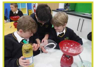
Year 6 muffin making in D.T.