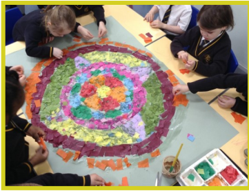
A rangoli pattern in Reception