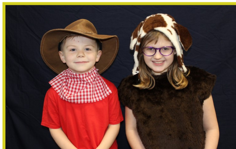
Dressed in costume ready for Prickly Hay