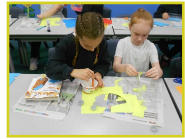
Year 2 creating collages in Art

Foundation Stage This half term the focus has been Diwali. The children have found out all about the Festival of Light and have enjoyed making Diva Lamps, Rangoli Patterns and Mehndi hand designs. They have also been sharing Christmas stories such as The Nutcracker and the Polar Express. The children enjoyed writing letters to Santa to tell him what they would like for Christmas this year.