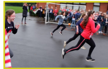
Full speed ahead in the Santa Dash