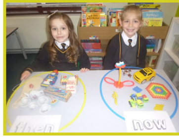
The Year 1 sorting objects in History