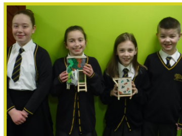
Year 5 D.T. birdhouses