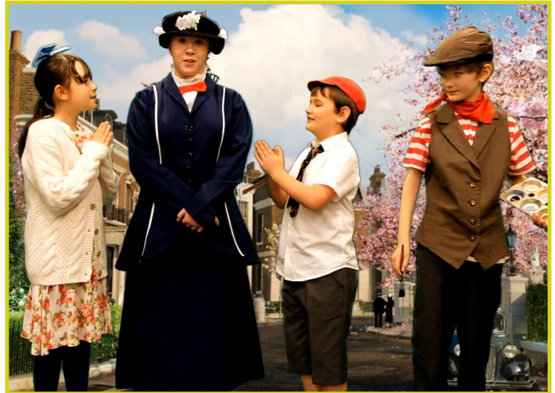
Jane, Mary, Michael and Bert during the performance of Mary Poppins