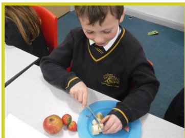
Healthy food preparation in Year 3

Year 6 have been finding equivalent fractions using pizzas and KitKats to deepen their understanding in a real-life context. In English, the children have thoroughly enjoyed reading the book 'Wonder' by R.J. Palacio from which they have produced a number of independent written pieces including a formal balanced argument. In Science, Year 6 have been fascinated to study Evolution and Inheritance, using their knowledge of genetics to create their own animal. In Geography, the children also studied The Water Cycle, looking closely at cloud coverage and the water filtration process. During D.T. lessons this term, the children have tasted, designed, created and evaluated their own marvellous muffins. They thoroughly enjoyed themselves and gave the 'British Bake Off' contestants a run for their money.