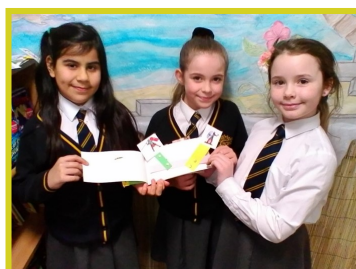
Roman D.T. books in Year 4