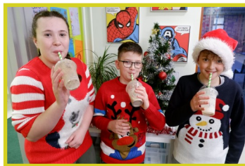
Tasty treats for Christmas