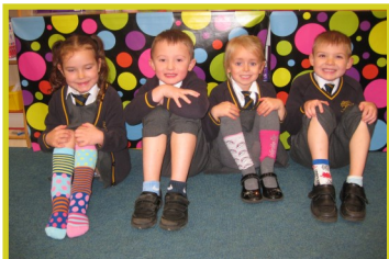
A super selection of odd socks

To raise money for Children in Need this year, the children took part in Children in Need's 'Five to Thrive' - a week of well-being activities led by Joe Wicks, Dr Radha and Blue Peter. Throughout the week, the children learnt about the '5 Ways to Well-Being' to help them develop their understanding of how we can look after our own mental health, as well as how to help others. Every morning, all classes enjoyed completing a Joe Wicks workout video to reinforce the importance of exercise for having good mental health and, to round off the week, the school participated in 'Joe's Ultimate Feel Good Friday Fundraiser'. Well done to the children and staff for making it through the burpee and squat pain to complete their Children in Need P.E. challenge, and a huge thank you to everyone for all of your generous donations - the school raised a substantial amount of money for this very good cause.