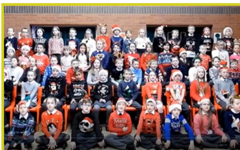
Year 3 and 4 Seasonal Singers

A huge well done to the children in Year 1 and 2 for their performance of Prickly Hay. The Year 2 children took the leading roles and worked extremely hard on learning and perfecting their speaking parts. Both year groups performed some fantastic dance routines and the singing was excellent. The costumes, enthusiasm and smiling faces made the nativity very enjoyable to watch. A huge thank you to all of the staff involved for bringing the super show to life.