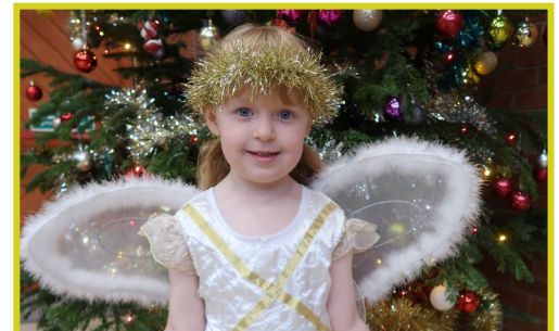
All smiles in the Nativity performance