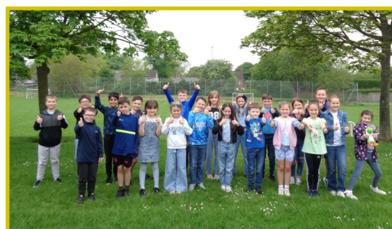
Children wearing denim and blue for Dementia Awareness Day

On Friday 19th May, children and staff came to school dressed in denim and the colour blue to raise money for the Alzheimer's Society, which helps to improve the lives of people living with dementia. As part of the day, children took part in a range of learning activities to develop their understanding of supporting those with dementia. Thank you to everyone for their efforts and generous contributions towards this great cause.