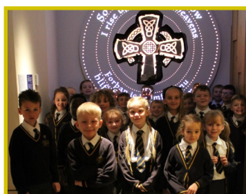
Year 2 at Bishop Auckland Faith Museum