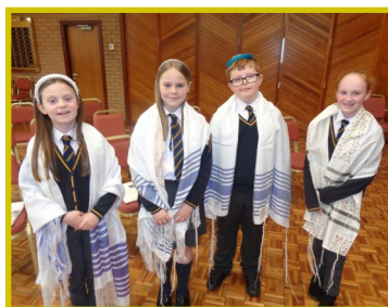
Year 5 at Newcastle Reform Synagogue