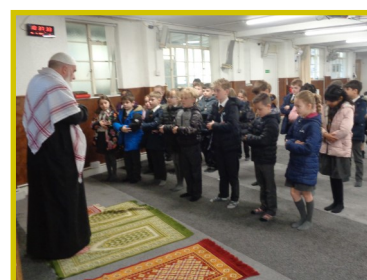
Year 3 at Newcastle Central Mosque

During this half term, the whole school took part in Multicultural Week. This fantastic celebration of culture helped to further develop the children's knowledge and understanding of cultural diversity in the local area, Britain and around the world today. A wide range of exciting learning activities took place throughout the week such as tasting traditional foods, exploring traditional music, learning and performing a range of dances and studying and creating cultural-inspired art. All of the children also took part in an African drumming workshop, which was equally as loud as it was exciting. To round off the week, the whole school gathered together outside to display their artwork, masks, flags and headwear that they had designed and created during the week. The children then proudly paraded around the school yard to carnival music, before dancing together to the song learnt during the week. All of the children right across the school thoroughly embraced Multicultural Week with a great respect for culture - well done to everyone for their fantastic efforts and to all involved in the organisation of the excellent week of cultural learning.