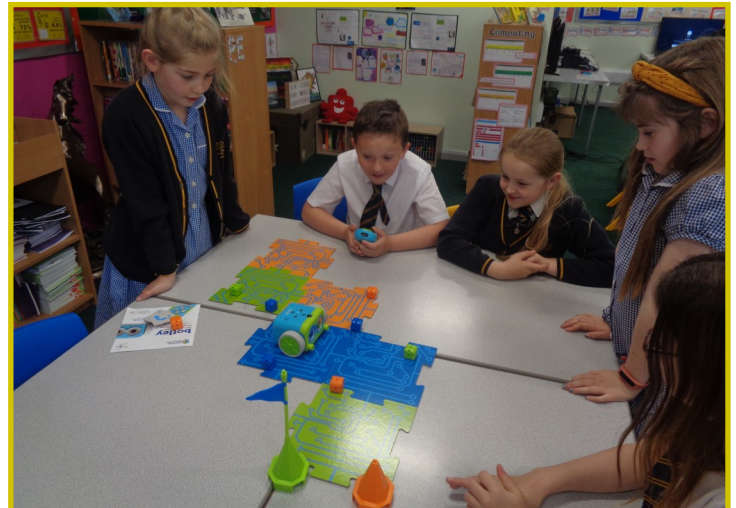
KS2 children at STEM club showing their understanding of robotic coding

Representatives from both the Lear Corporation and the North East Automotive Alliance visited school to formally hand over the donation to members of the STEM afterschool club and STEM Subject Leaders. As part of their visit, the representatives were impressed by the use of coding equipment such as the Code and Go mouse, Botley 2.0 coding robot and the more advanced Micro:bit coding blocks as used by upper KS2 children. The representatives then spoke to the children about careers in the engineering sector and also answered a range of questions from the children.