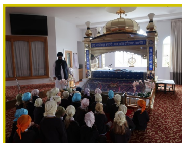
Year 1 at the Newcastle Gurdwara