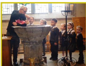
Reception at St Michael and All Angels