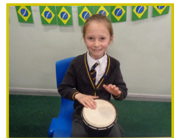
Year 4 African drumming workshop