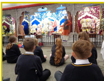
Year 4 at Newcastle Hindu Temple

During this half term, the whole school took part in Multicultural Week. This fantastic celebration of culture helped to further develop the children's knowledge and understanding of cultural diversity in the local area, Britain and around the world today. A wide range of exciting learning activities took place throughout the week such as tasting traditional foods, exploring traditional music, learning and performing a range of dances and studying and creating cultural-inspired art. All of the children also took part in an African drumming workshop, which was equally as loud as it was exciting. To round off the week, the whole school gathered together outside to display their artwork, masks, flags and headwear that they had designed and created during the week. The children then proudly paraded around the school yard to carnival music, before dancing together to the song learnt during the week. All of the children right across the school thoroughly embraced Multicultural Week with a great respect for culture - well done to everyone for their fantastic efforts and to all involved in the organisation of the excellent week of cultural learning.