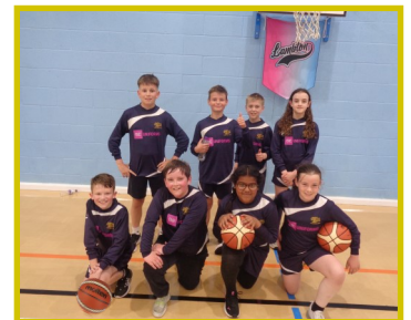
The school basketball team