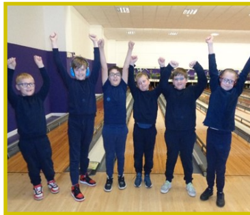
The ten-pin bowling team celebrating