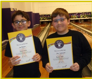
Individual high score certificates