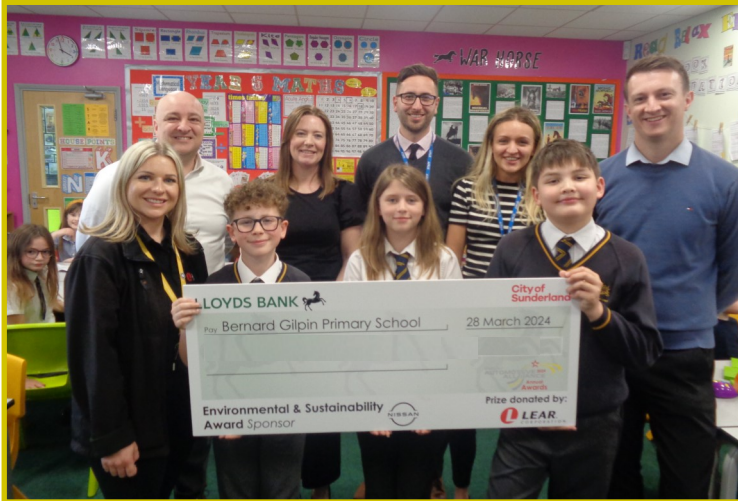
Members of the STEM club receiving the grant alongside teaching staff

Bernard Gilpin Primary School has recently received a generous donation in order to further enhance the existing STEM curriculum in school. Earlier this year, the Lear Corporation, a global manufacturer of car seats based in Houghton-le-Spring, won the 'Environmental and Sustainability Award' at the annual North East Automotive Alliance Awards. This led to Lear selecting Bernard Gilpin Primary as the recipient to donate a sum of money as part of their award. The popular STEM after school club will also be enhanced further through the gifting of a brand new, state-of-the-art robotics kit.