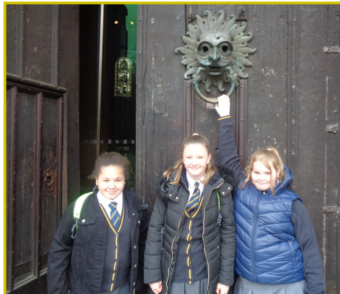
Year 6 on their educational visit to the inspirational Durham Cathedral

All of the children across the school took part in a range of educational visits to places of worship, linking to the religions studied during this half term. The children in Reception enjoyed their visit to St. Michael and All Angels Church to develop their understanding of Christian worship. Year 1 thoroughly enjoyed their visit to the Sikh Gurdwara in Newcastle, where they learnt about Sikhism. The children of Year 2 experienced a tour of the brand new Faith Museum in Bishop Auckland and Year 3 visited the Newcastle Central Mosque, to enhance their understanding of Islam. Year 4 visited Newcastle Hindu Temple, where they developed their knowledge of Hindu worship, whilst Year 5 enjoyed their visit to Newcastle Reform Synagogue to deepen their understanding of Judaism. Finally, Year 6 visited the world-famous Durham Cathedral to deepen their understanding of Christian places of worship.