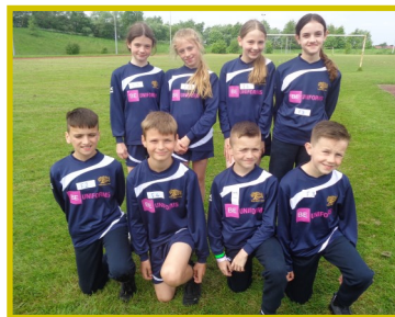
The Year 5 & 6 Quad Athletics Team

The school A-Team continued their season in the Hetton and Lambton 7-a-side League with a number of impressive wins. The school B-Team and C-Team have also continued to perform well, winning a number of their games played in recent weeks. The Year 4 football team also performed well in their first games representing the school. The team played a number of highly competitive matches with some excellent football along the way, resulting in them progressing to the Final of the Year 4 County Cup competition held later this year. Well done to all of the teams and players involved for representing themselves and the school in such a positive way.