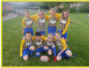
The Girls' Football Cup Finalists