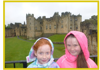
Year 4 at Alnwick Castle

Foundation Stage visited Northumberland County Zoo in relation to their 'Pets and Animals' theme in school. The children were excited to feed the llamas and wallabies, as well as learning how to care for the baby Joeys. They also had the opportunity to ask a zoo keeper questions relating to the care of the wide variety of animals in the zoo.