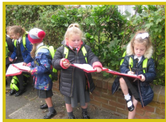
Year 1 at Rectory Park