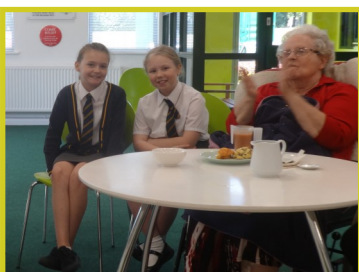
Singing at Dementia Friends

Four children from Year 5 were recently invited to take part in the Primary Engineer Festival, held at Gateshead College. The children were delighted to show off the fully functioning remote controlled cars that they had designed, built, tested and evaluated during the recent and highly successful Design Technology 'Make it Day' in school. The children enthusiastically explained how they had been involved in every stage of the creation of the car, before giving a demonstration of the car in action. A big well done to all involved!