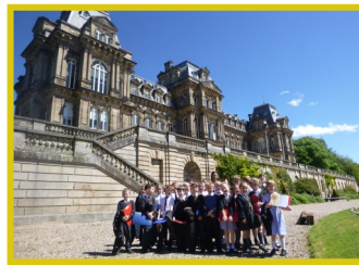
Year 3 at Bowes Museum