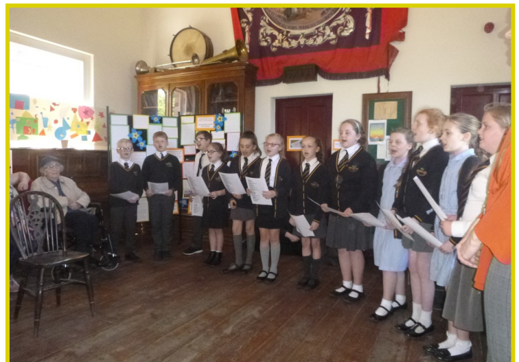
The school choir entertaining the audience at Beamish Museum

Also during the week, all children in school took part in various activities based around raising awareness of dementia including reading stories to develop their understanding of the condition and looking at ways to help people living with dementia. Staff also spoke about their own experiences of dementia during assemblies. To end the week, the staff and children came to school dressed in blue and white and donations were sent to the Alzheimer's Society.