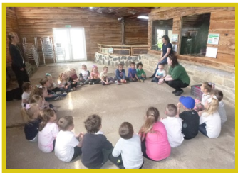
Reception at Northumberland Zoo