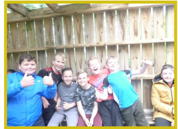
A big thumbs up for The Hub