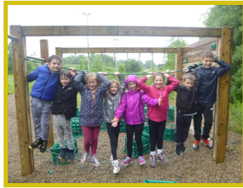
Team building on the assault course