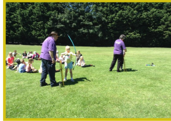
Year 1 archery