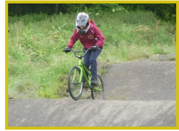
Getting air on the BMX track

Children from Year 3 have recently returned from an action-packed, two day residential at The Hub. The fantastic facilities, located at Barnard Castle gave the children the opportunity to try their hand at archery, climbing the high ropes course, riding a BMX around the purpose-built track, cooking pizzas in the outside oven, toasting marshmallows on the fire pit and participating in a carousel of other sporting activities. The enthusiasm that the children displayed by encouraging each other during activities helped them to develop their own communication, team-building and inter-personal skills, which are essential to use throughout their lives. It allowed for friendships to flourish and certainly made many unforgettable memories on the children's first school residential. The younger children were also joined on the overnight stay by children from Years 5 and 6, who came along as mentors. The older children were absolutely fantastic with their assistance, as well as encouragement, of the Year 3 children. The children were absolutely amazing throughout the visit - a real credit to themselves and the school. A huge thank you and well done to everyone involved - what an action-packed and amazing two days!