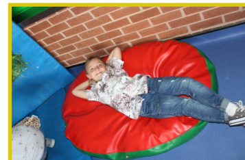
Chilling at the Summer Disco