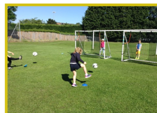
Sponsored Penalty Shootout

A group of children took part in the annual Sunderland Schools Dance Festival at The Sunderland Empire. This year's theme was 'Environmental Issues' and the children performed an excellent 'Jungle Fever' routine around the issue of deforestation. Everyone was very proud of the level of effort that was put into the rehearsals and the animal costumes looked amazing. Well done to the dance team – the hard work definitely paid off!