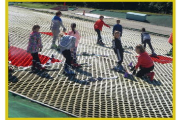
Year 3 skiing at Silksworth

Foundation Stage children visited the outdoor 3G pitch at Houghton Sports & Wellness Centre. They received specialist football coaching and learnt many new skills including how to pass and dribble the ball with improved accuracy.