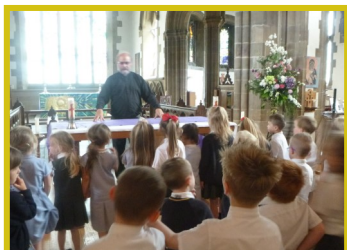
Reception at Sunderland Minster