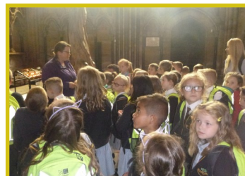
Year 2 at Durham Cathedral