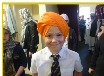
Year 6 at Sunderland Gurdwara