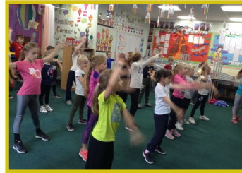
Year 2 dancing session