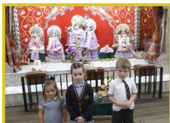
Year 1 at the Hindu Temple