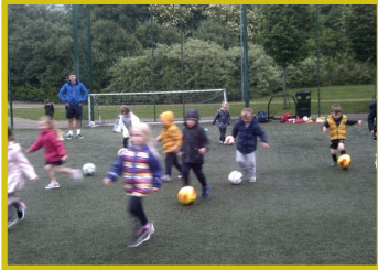
Reception football skills