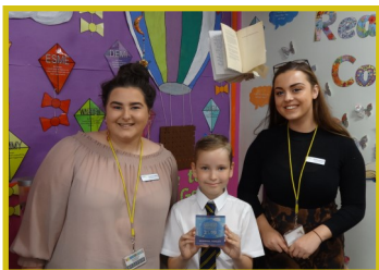
The Explore Learning Writer's Award