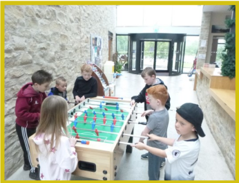
Enjoying a game of table football

Children from Year 3 have recently returned from an action-packed, two day residential at The Hub. The fantastic facilities, located at Barnard Castle gave the children the opportunity to try their hand at archery, climbing the high ropes course, riding a BMX around the purpose-built track, cooking pizzas in the outside oven, toasting marshmallows on the fire pit and participating in a carousel of other sporting activities. The enthusiasm that the children displayed by encouraging each other during activities helped them to develop their own communication, team-building and inter-personal skills, which are essential to use throughout their lives. It allowed for friendships to flourish and certainly made many unforgettable memories on the children's first school residential. The younger children were also joined on the overnight stay by children from Years 5 and 6, who came along as mentors. The older children were absolutely fantastic with their assistance, as well as encouragement, of the Year 3 children. The children were absolutely amazing throughout the visit - a real credit to themselves and the school. A huge thank you and well done to everyone involved - what an action-packed and amazing two days!