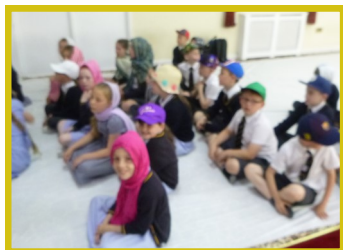
Year 3 at the Sikh Gurdwara

This year, Multi-Cultural Week was a whole school celebration of cultural differences helping to develop the children's knowledge and understanding of the cultural diversity in Britain today and in the North East. There was a wide range of exciting learning activities taking place throughout the school such as cooking and tasting different foods; exploring music, dance and traditional dress; studying symbolism and creating cultural inspired art. There were also many books and artefacts delivered to school by the library service, which were displayed and used in all classrooms throughout the week to enhance learning.