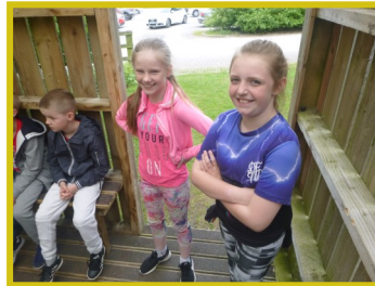
Year 6 mentors on hand to help