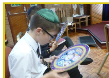
Year 5 at the Reform Synagogue