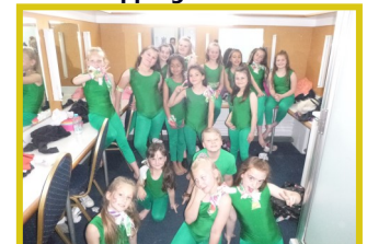
The Dance Festival troupe