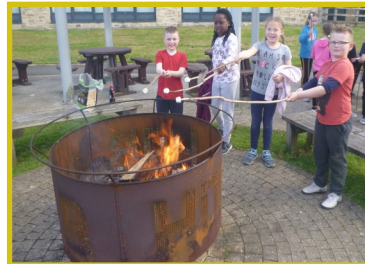
Enjoying toasted marsh mallows