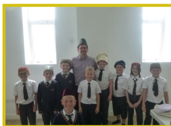
Year 4 at Sunderland Mosque

A great deal of learning also took place outside of the classroom, with children from across the school going on multicultural educational visits. The children in Reception visited Sunderland Minster to help develop their understanding of Christian places of worship, as did the children in Year 2, who visited the inspirational Durham Cathedral. Both Year 1 classes visited the Hindu Temple where they learnt about the different Hindu Gods. The children of Years 3 and 6 visited the Sunderland Gurdwara, to enhance their understanding of Sikhism. In relation to their theme of Islam, Year 4 visited Hartlepool Mosque where they were warmly welcomed and enhanced their knowledge of Muslim worship. The children of Year 5 were fascinated when they visited the Reform Synagogue in Newcastle to further develop their understanding of Judaism. All children thoroughly embraced Multicultural Week with great respect for cultural differences. Well done to everyone involved in the organisation of the week.