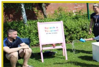
Soak the Teacher at the Fayre

The annual Summer Fayre was a great success. A huge thank you to Friends of Bernard Gilpin who helped to organise the fayre and thank you to parents/carers for your generous contributions. A tremendous amount of time and effort goes into the organisation and all money raised will be used to support activities in school. Thank you also to our friends for organising the summer disco and to our excellent school council DJs for providing the music. The children really enjoyed the beach party theme and many prizes were won for the best dance moves!