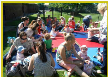
Fun in the sun at Toddlers