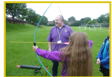
Sports Week Action