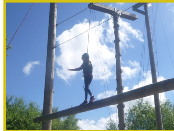
Daring the high ropes course