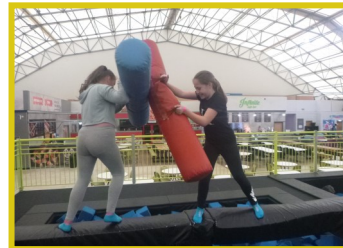
Year 6 at Infinite Air