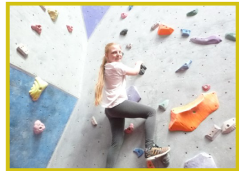
Year 5 at Sunderland Climbing Wall