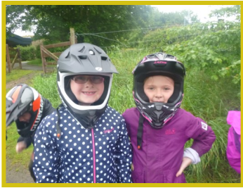
Getting ready to give BMXing a go