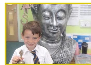
Multicultural Artefacts in school