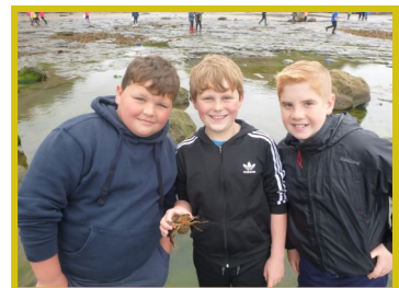
Everyone enjoyed rockpool bingo, where they tried to find as many of the creatures on their board as possible - all of which were returned unharmed!